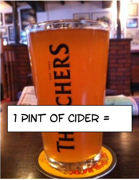
1 PINT OF CIDER =