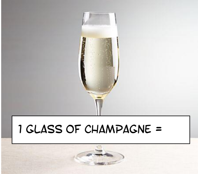
1 GLASS OF CHAMPAGNE =