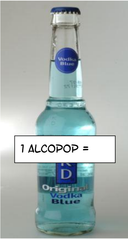
1 ALCOPOP =