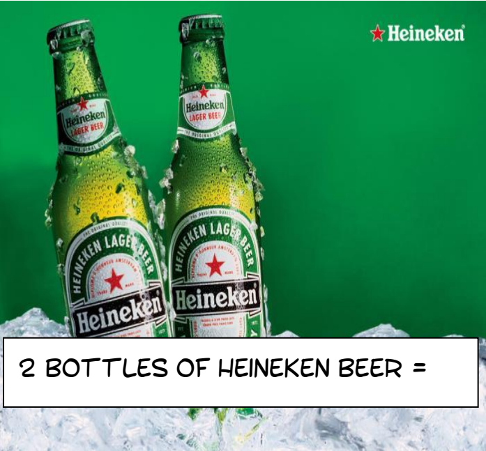
2 BOTTLES OF HEINEKEN BEER =