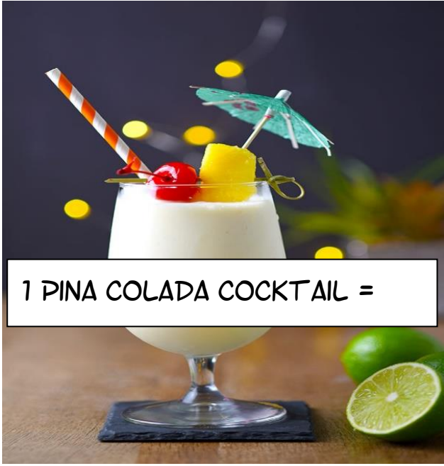
1 PINA COLADA COCKTAIL =