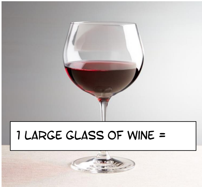
1 LARGE GLASS OF WINE =